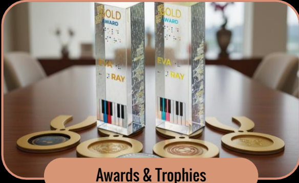
Awards & Trophies