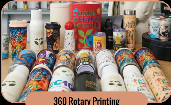
360 Rotary Printing